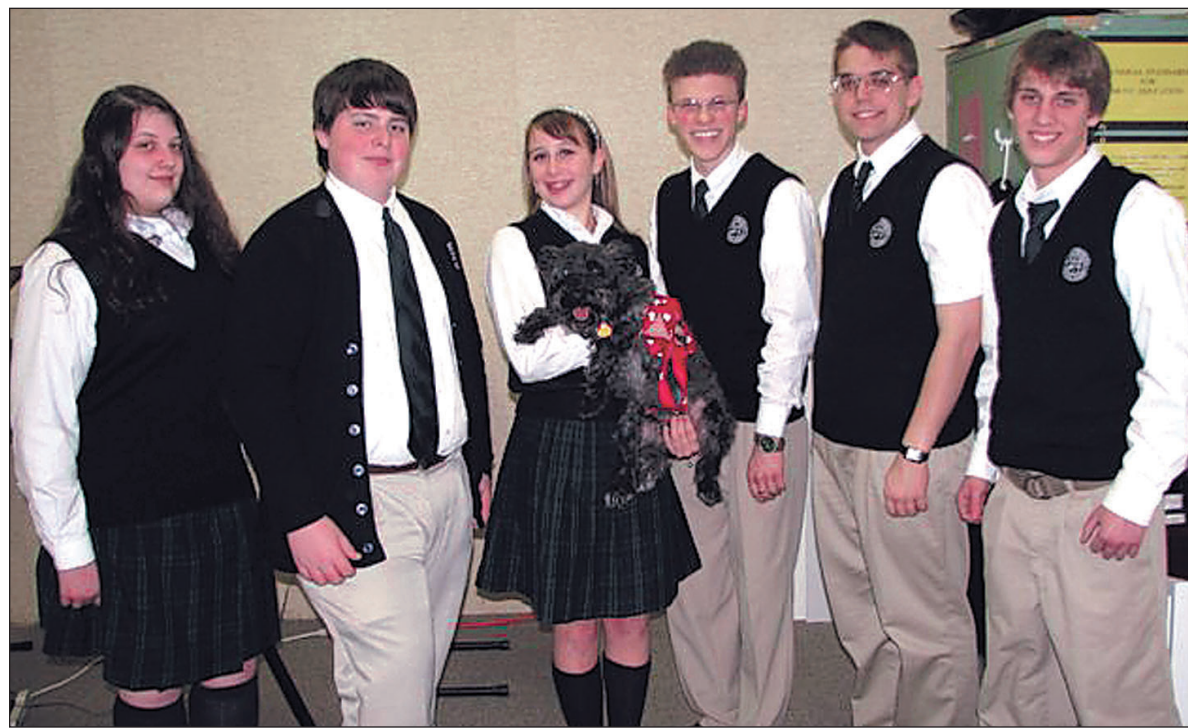
The St. John Neumann Regional Academy's cast of "Wizard of Oz" is shown above. The school will have performances April 4 to 6 at the high school, 901 Penn St.